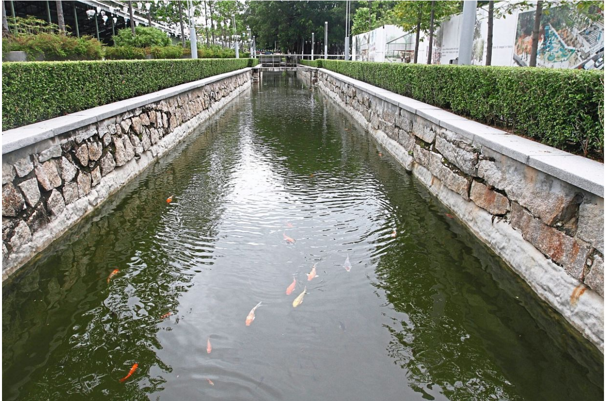
Fish swimming in the Prangin Canal.

“We just wanted to rejuvenate ourselves after staying home for so long.