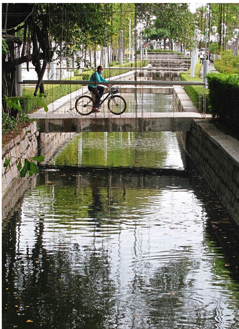
A visitor cycling across the canal.

“We have heard so much about this park and we are not disappointed.