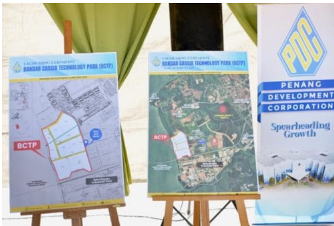
The location plan displayed at the event today.

BCTP will serve as an extension of the existing Batu Kawan Industrial Park (BKIP), which is home to more than 170 companies, including renowned names like Lam Research, Boston Scientific, VAT Manufacturing, Dexcom, Vitrox, Pentamaster, Greatech, UWC and many others.