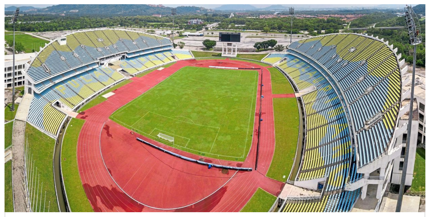
Aerial view of Penang State Stadium in Batu Kawan, which opened in 2000 and can seat 40,000. It was one of the first projects undertaken by PDC.

About 500 units of affordable housing have been built out of the total 12,000 units planned.