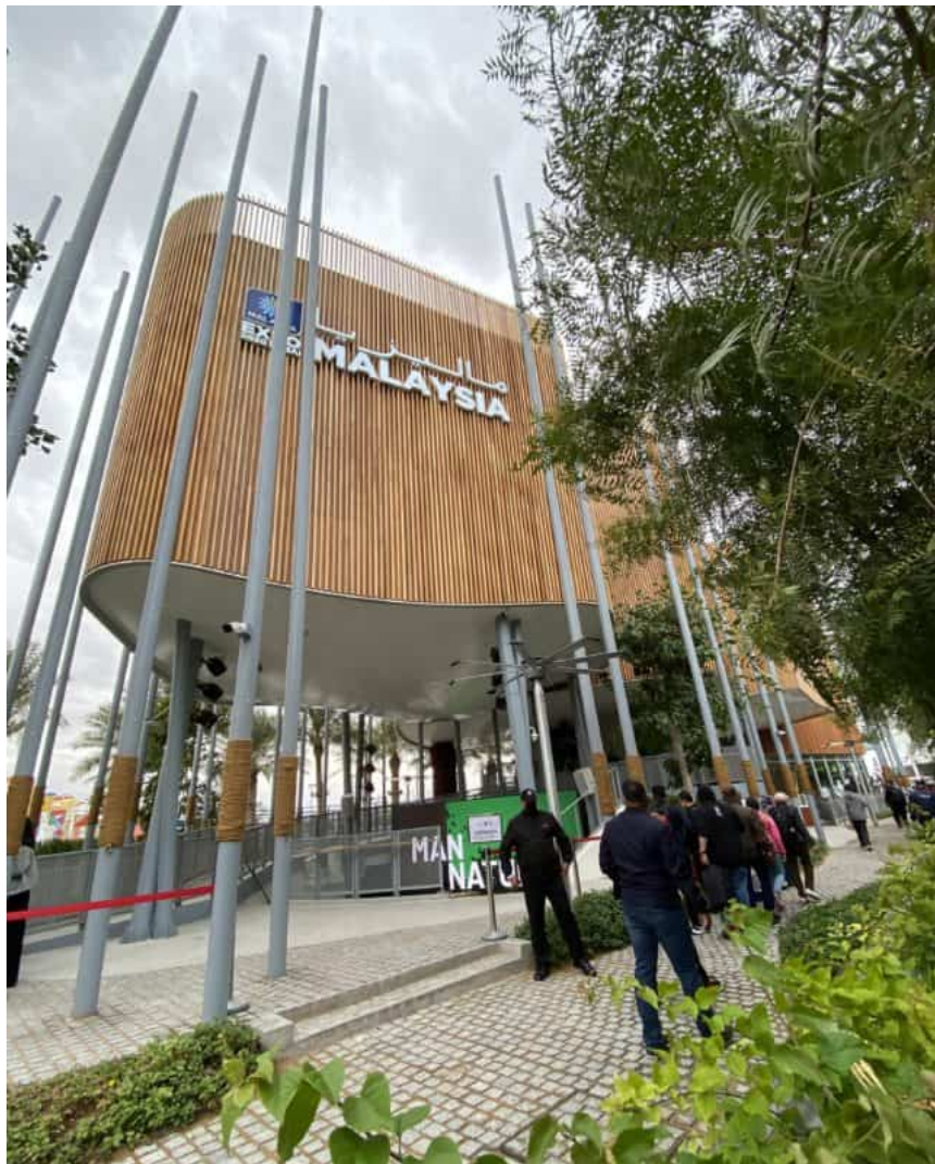
The Malaysia Pavilion at Expo 2020 Dubai.

"Be it in the field of business and industry, technology, health, education, agritech, tourism or culture, we are proud to be here to bring Penang to you!